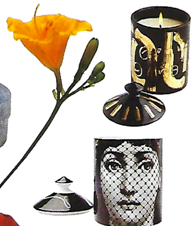
Fornasetti Candles: $100.00 each