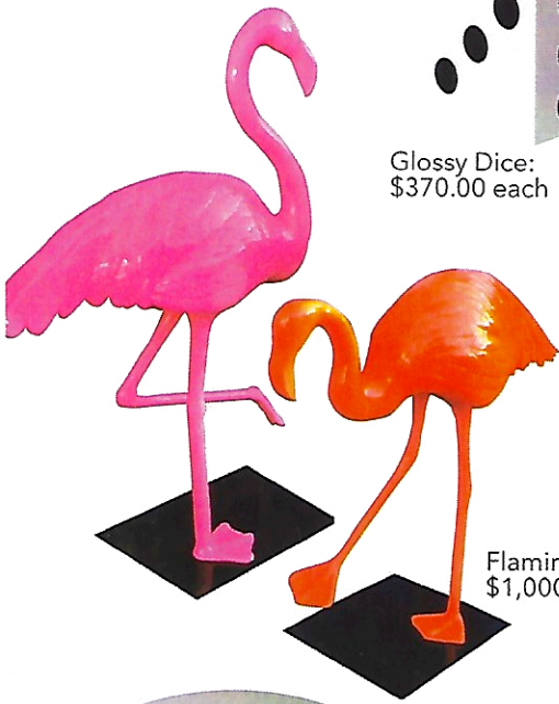
Flamingo Statues: $1,000.00 each