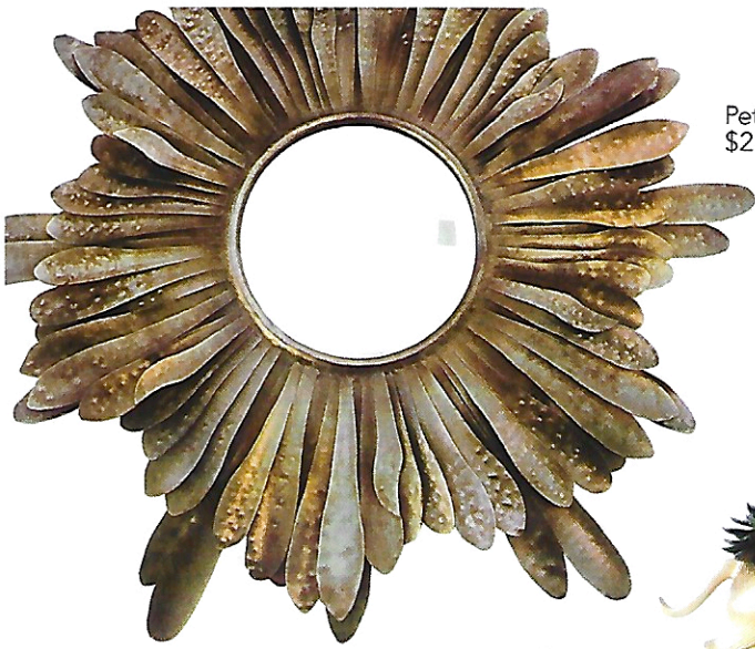
Petals Mirror: $270.00