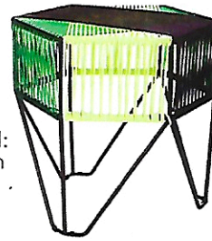
Martina Stool: $300.00 each