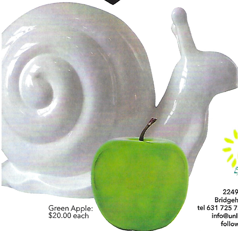
Green Apple: $20.00 each