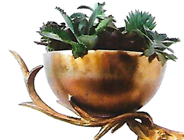
Brass Deer Planter: $400.00

By Award Winning Landscape Designer Frederico Azevedo