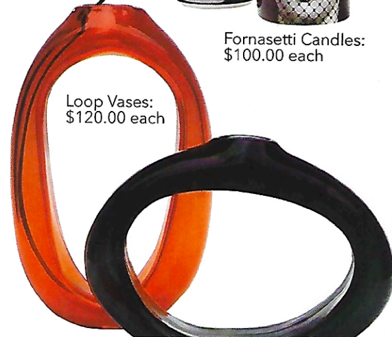
Loop Vases: $120.00 each

2249 Scuttle Hole Rd, Bridgehampton, NY 11932 tel 631 725 7551 • fax 631 537 3138 info@unlimitedearthcare.com follow us on instagram