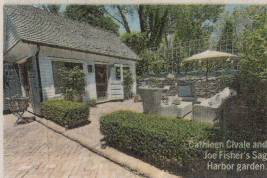
Cathleen Civalé and Joe Fisher's Sag Harbor garden.