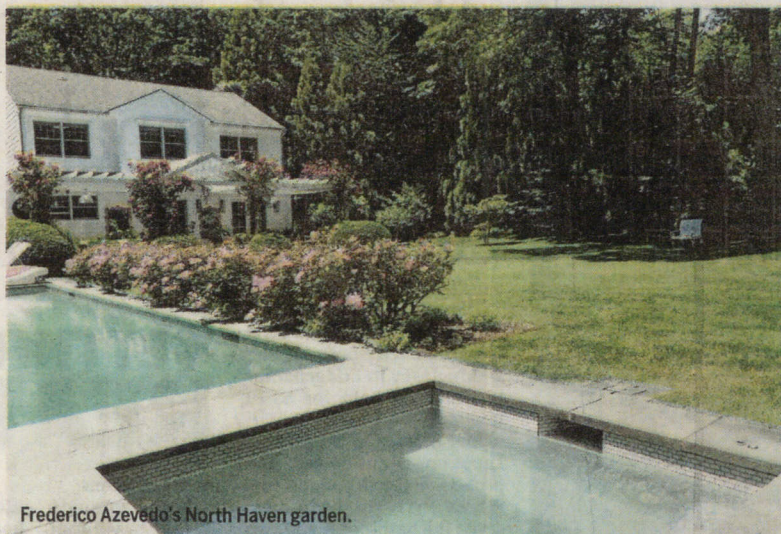
Frederico Azevedo's North Haven garden.