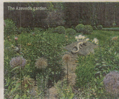
The Azevedo garden.