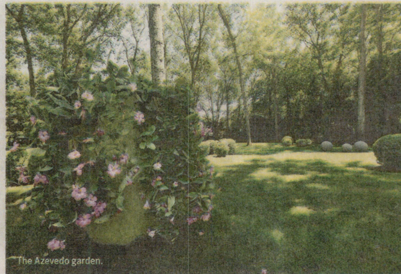
The Azevedo garden.