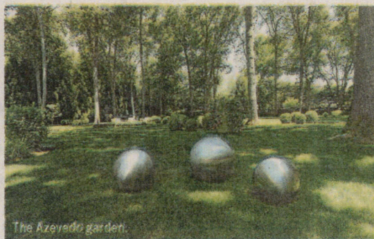
The Azevedo garden.