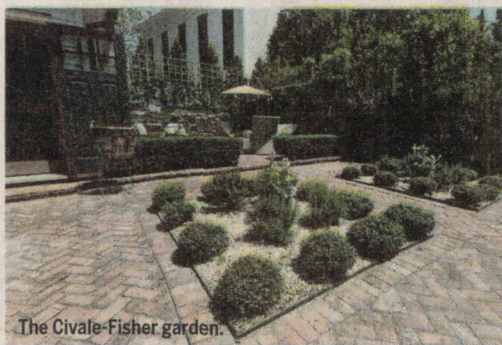
The Civalé-Fisher garden.