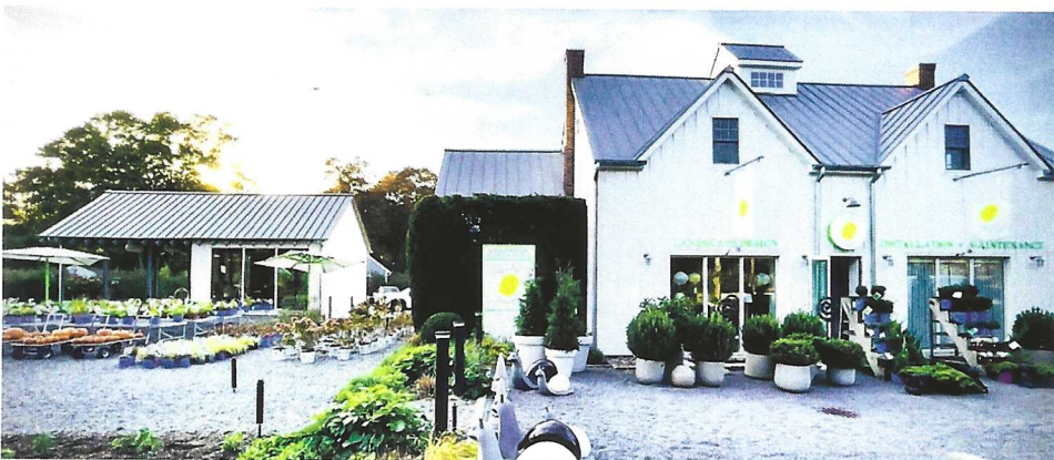
Unlimited Earth Care Garden Market is filled with items for your spring garden. John Erickson

Unlimited Earth Care Garden Market, open every day from 9 a.m. to 5 p.m., including Saturday and Sunday, at 2249 Scuttle Hole Road, Bridgehampton. More information can be found online at www.unlimitedearthcare.com or by emailing info@unlimitedearthcare.com or calling (631) 725-7551.