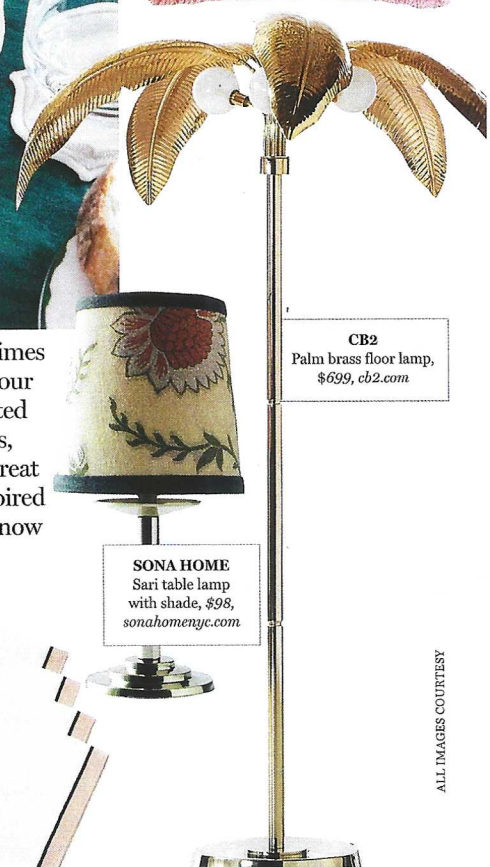
SONA HOME Sari table lamp with shade, $98, sonahomenyc.com