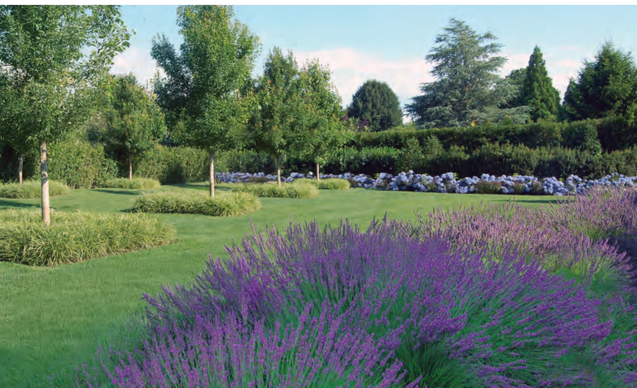
Gardens edged by Maple trees with beds of Carex Ice Dance, Lavender Provence and Endless Summer Hydrangeas.

"Simplicity means choosing native and well-