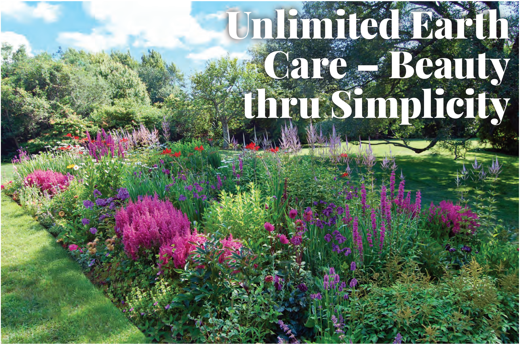
Perennial garden with native and well-adapted flowers that bloom from early spring to fall.